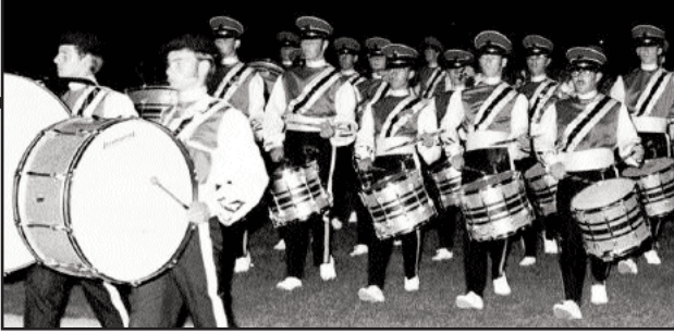
At Canadian Nationals, year unknown.

Ontario and Gatineau, Buckingham, St. Jerome and Montreal in Quebec.