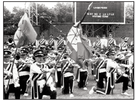
Cadets LaSalle at the1967 National Dream (photo by Moe Knox from the collection of Drum Corps World).

The corps was attracting the strongest players from the smaller neighboring junior B corps surrounding Ottawa -- Arnprior, Carleton Place, Smiths Falls and Kingston in